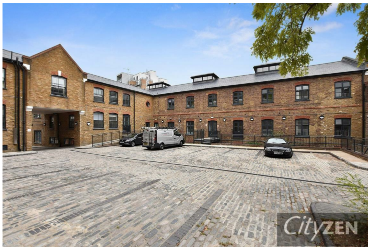
SAIL LOFT COURT