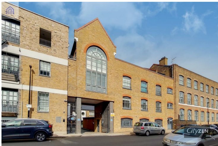
ROYAL QUAY ENTRANCE