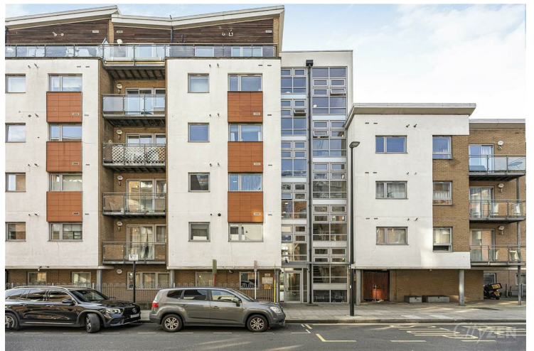
THE CUBIX APARTMENTS