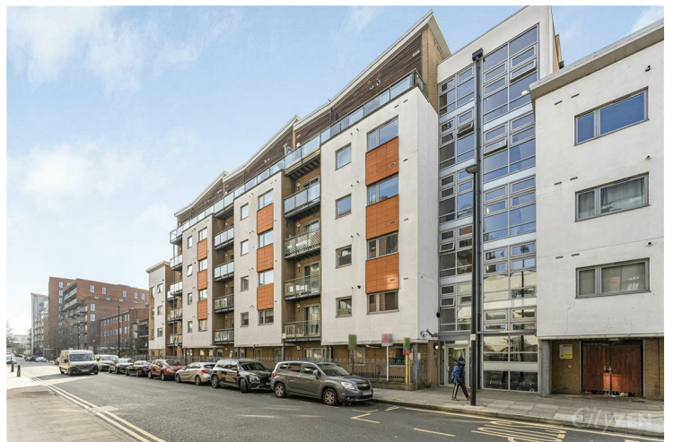
THE CUBIX APARTMENTS