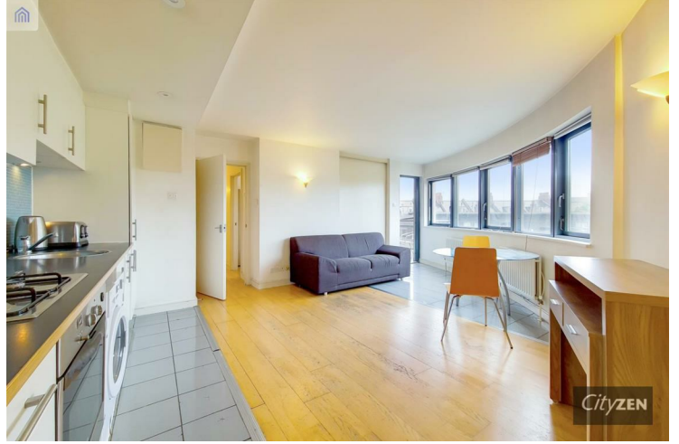
RECEPTION ROOM VIEW