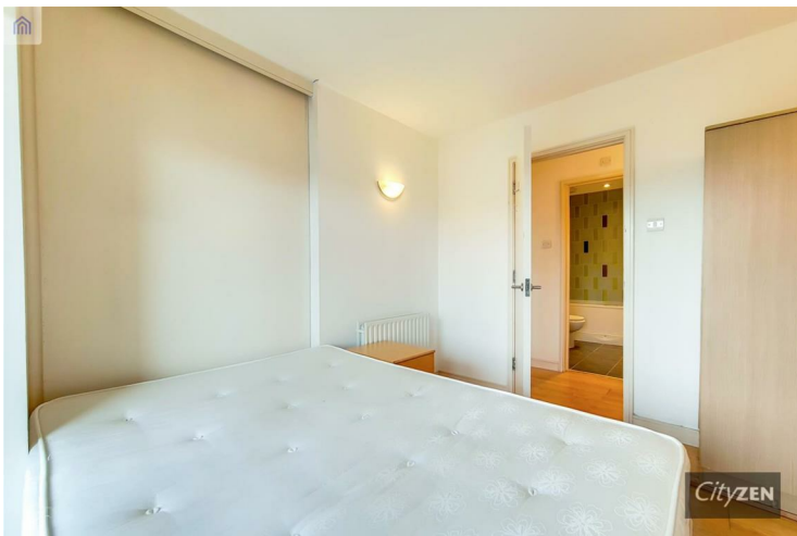
BEDROOM 2 VIEW