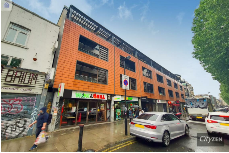
THE CHRONOS BUILDING