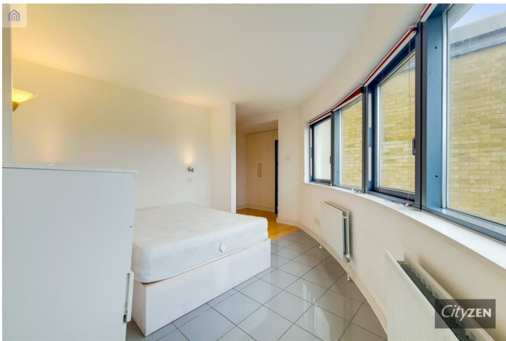
BEDROOM 1 VIEW